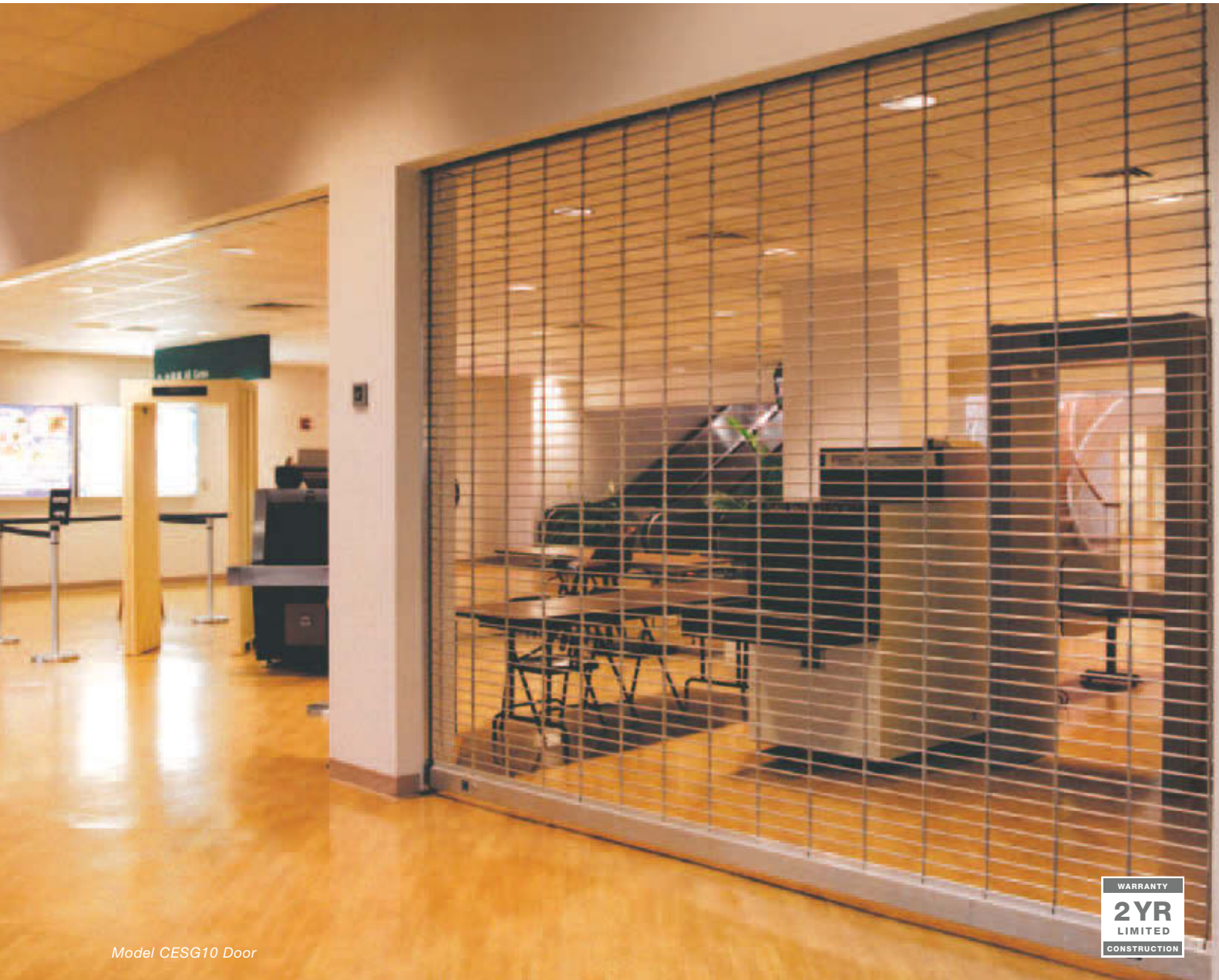
Model CESG10 Door