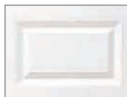
Short Traditional Raised Panel