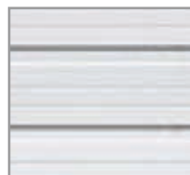
Ribbed Panel Design