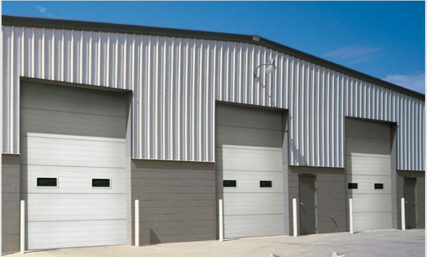
Model 520, 12'2" x 16' doors, shown with 24" x 6" Lites