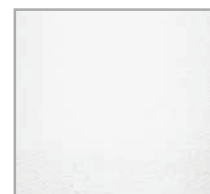
3718 Flush Panel