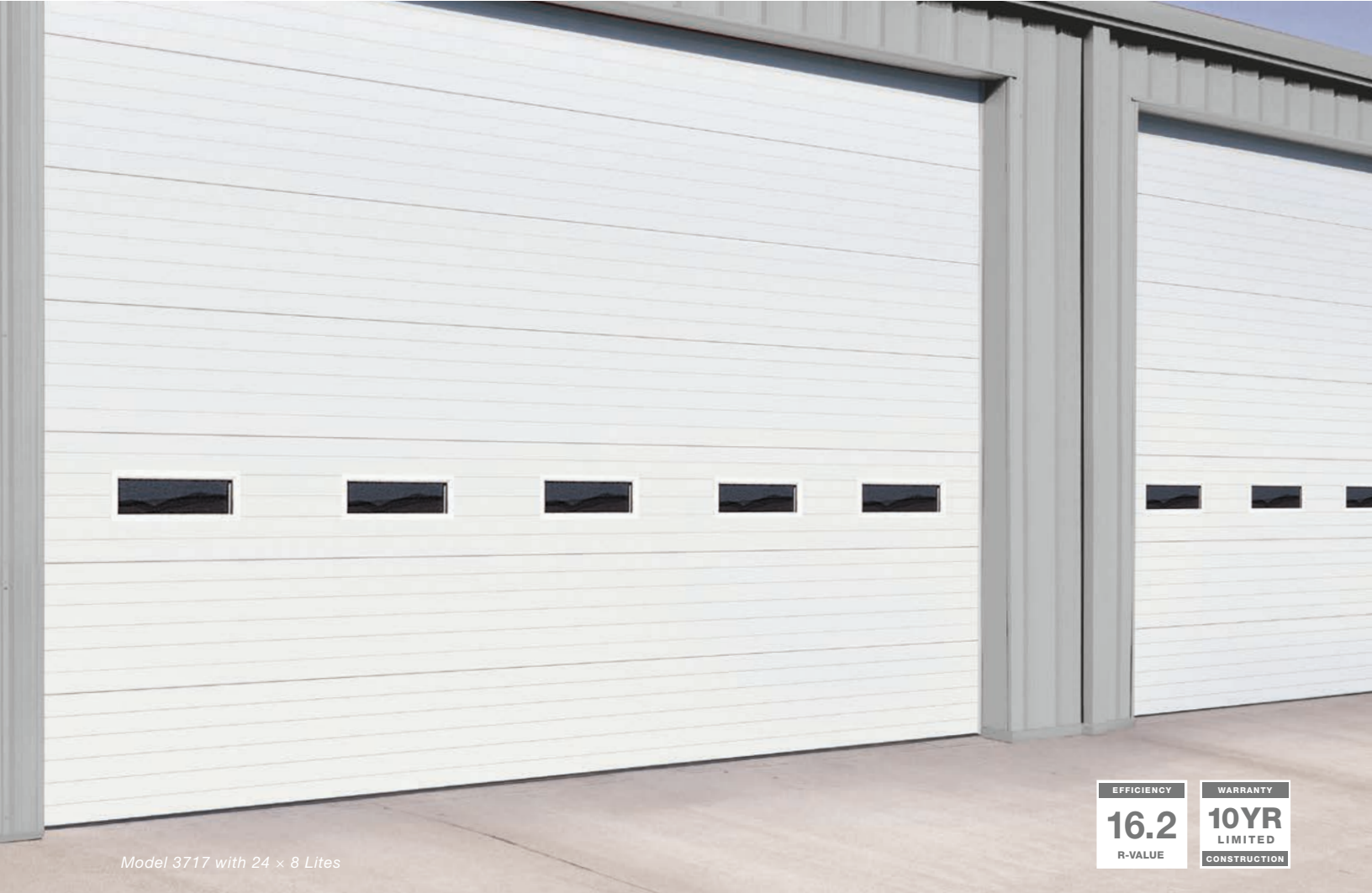
Model 3717 with 24 × 8 Lites