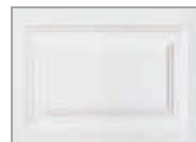
3213 Elegant Raised Panel