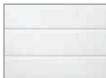
3200 Light Ribbed Panel