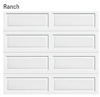
Ranch design not available in all areas. Consult dealer for availability.