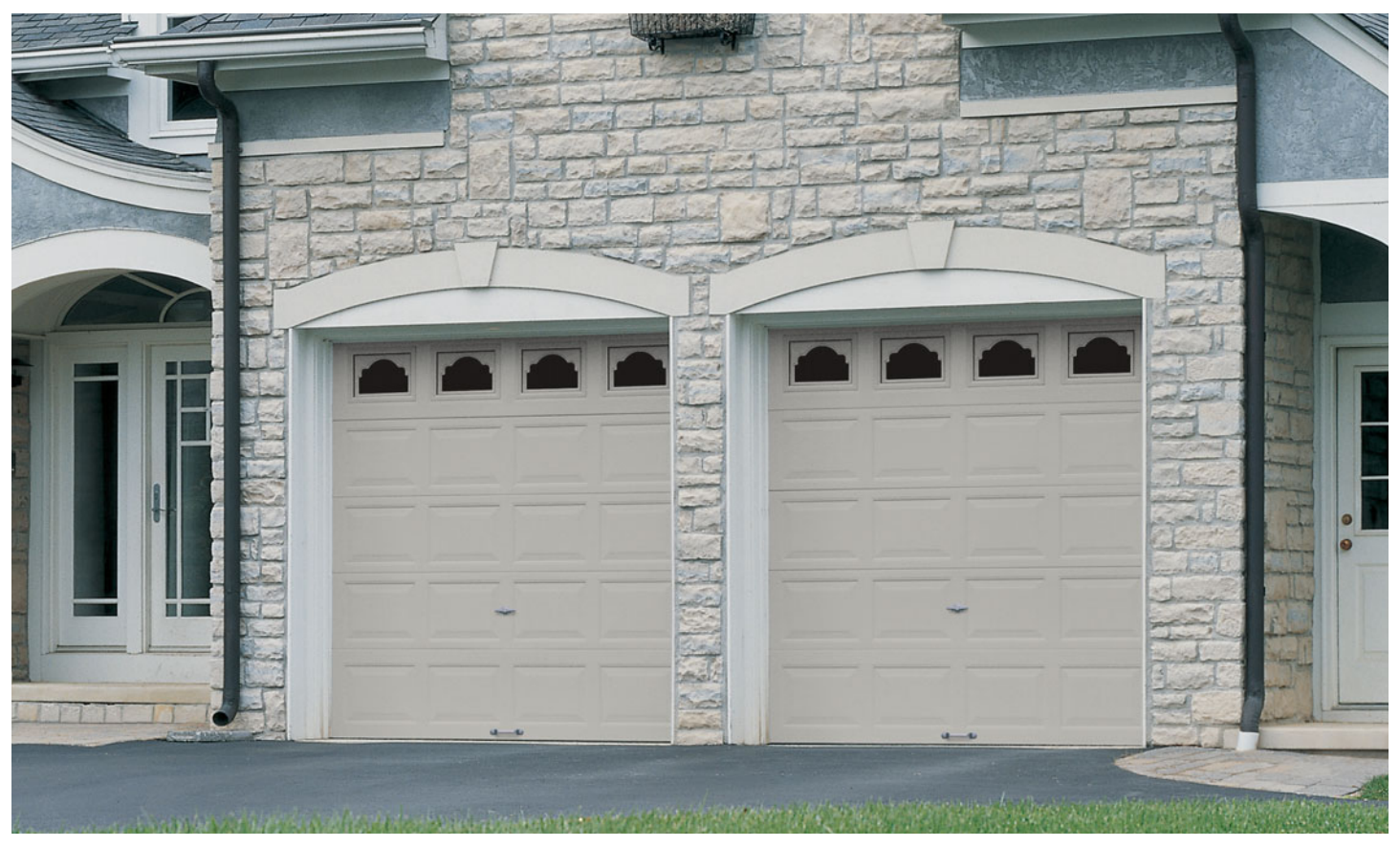
Model 8100 shown in Colonial design with Cathedral I window inserts