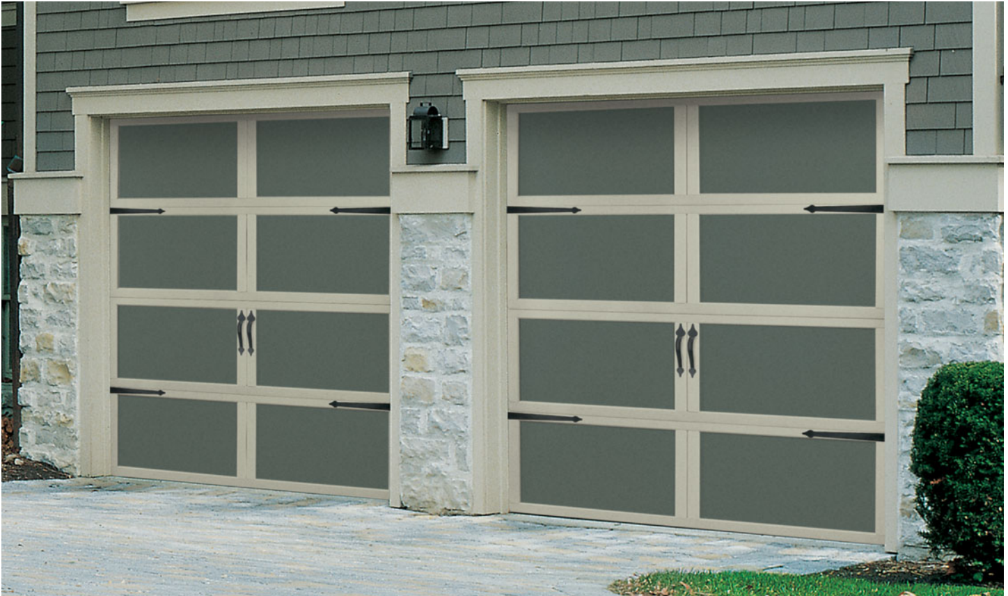
Model 9400 shown in Westfield design with optional decorative hardware